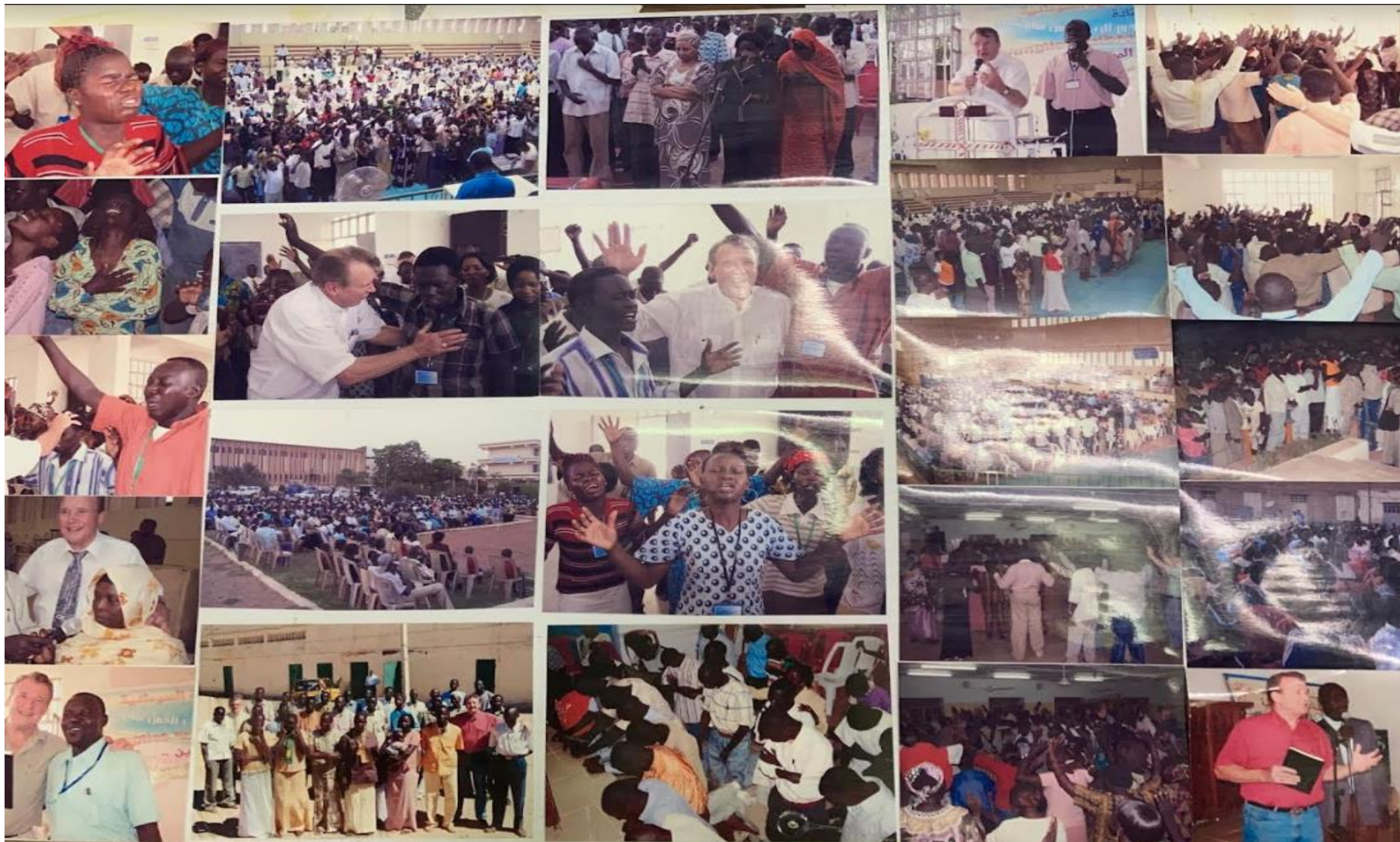
Darfur, Sudan 2006, 2007 Sudan