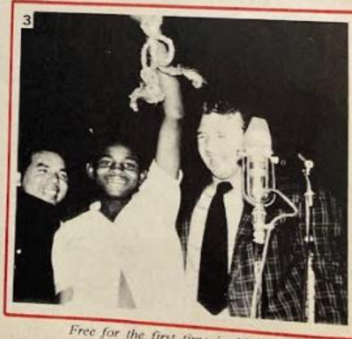
Free for the first time in 15 years.