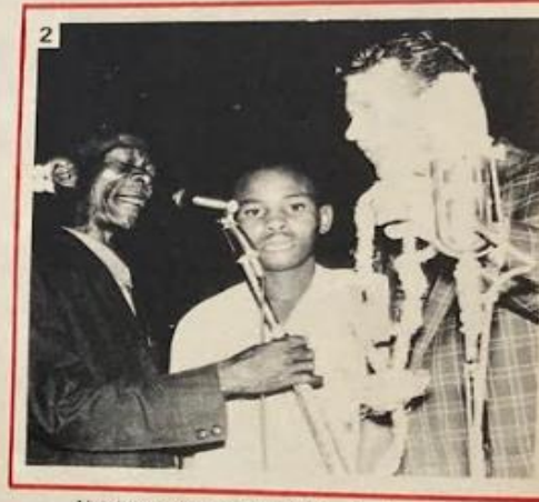
Neighbor weeps as he tells what happened.

3. The boy holding the rope that had bound him, smiles and testifies that for the first time in his life he is normal! (Notice how worn the rope is that they had tied him with daily for years)