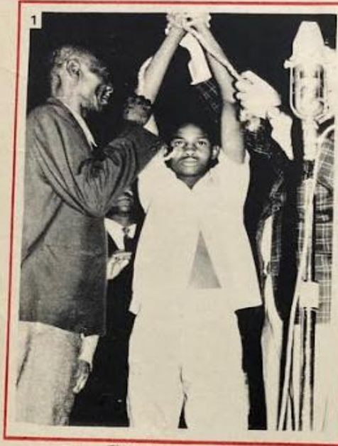
This is how he came.

1. Demon possessed 15 year old boy brought to the Football Stadium by a neighbor who had been converted a few nights before in the crusade. The boy had to be tied and dragged to the meeting because he was out of his mind.