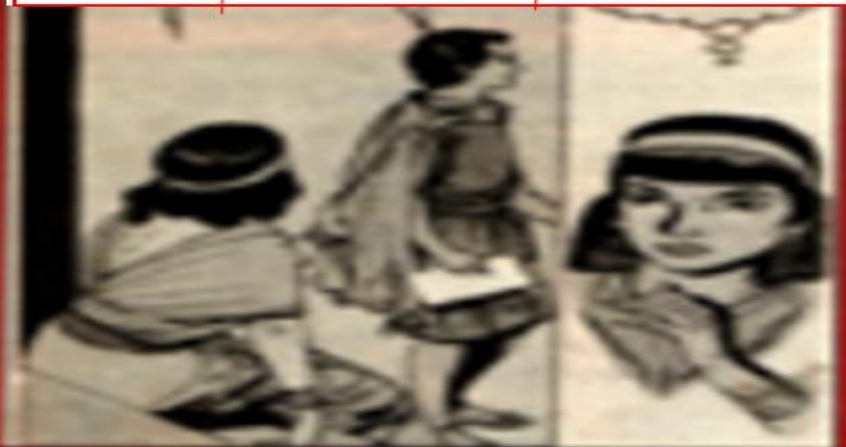
‘The Potiphar’s Wife Syndrome’ –

MUST YOU ALWAYS THINK OF POTIPHAR? HE IS MY MASTER I WILL NOT BE UNTRUE TO HIM OR DISOBEY MY GOD NO MAN CAN SCORN - ME AND LIVE.