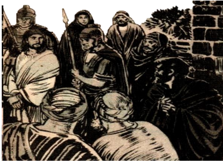
Peter commits gross sin, repents

FOR THE THIRD TIME PETER DENIES KNOWING JESUS AND THEN THE COCK CROWS! STARTLED, PETER RAISES HIS HEAD - TO LOOK STRAIGHT INTO THE EYES OF JESUS - WHO IS BEING LED OUT OF THE COURT