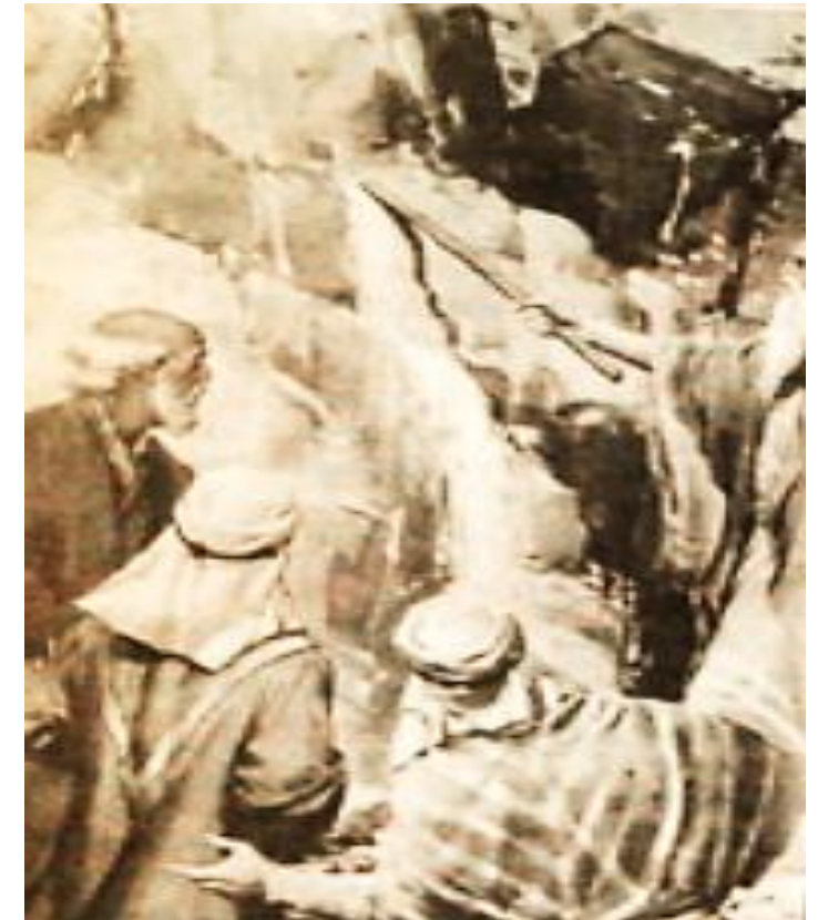
Moses disobey God