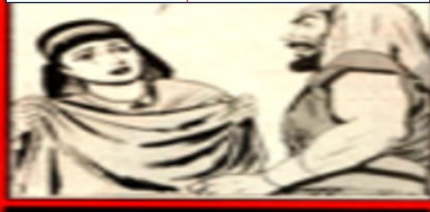
“If I can’t have him I’ll destroy him!”

YOUR HEBREW SLAVE TRIED TO KISS ME:AND HE LEFT...BUT HE DROP HIS ROBE. HERE SEE IT. I’LL THROW HIM IN PRISON FOR THIS