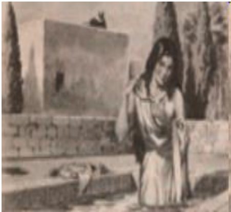
David commits adultery with Bathsheba

David wasn’t so spiritually wise. He went out of his way to sin with BATHSHEBA in an adulterous relationship. And even had her husband Uriah killed in battle to cover his sin. But God saw it all and King David had to pay . His son by Bathsheba died and the sword never did depart out of David’s House from that time forward. (II Sam. 12: 10)